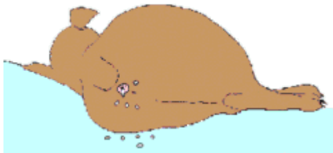
As Rover sleeps, tapeworm segments are passed

Once attached to the host intestinal wall, the tapeworm begins to grow a long tail. (The tapeworm's body is basically a head segment (to hold on with), a neck, and many tail segments). Each segment making up the tail is like a separate independent body, with an independent digestive system and reproductive tract. The tapeworm absorbs nutrients through its skin as the food being digested by the host flows past it. Older segments are pushed toward the tip of the tail as new segments are produced by the neckpiece. By the time a segment has reached the end of the tail, only the reproductive tract is left. When the segment drops off, it is basically just a sac of tapeworm eggs.