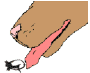
Rover licks himself and swallows fleas

Inside the cat or dog's stomach, the flea's body is digested away and the young tapeworm is released. It finds a nice spot to attach and the life cycle begins again. It takes 3 weeks from the time the flea is swallowed to the time tapeworm segments appear on the pet's rear end or stool. Proper flea control can help eliminate tapeworm infection.